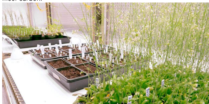
Above: Genetically modified plants at the Salk Institute.

Please note the Our Future Planet – Can carbon capture help us fight climate change? exhibition is still in development so content and exact object list are still subject to minor changes.