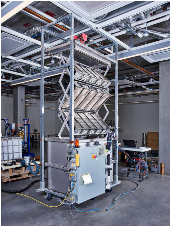
Above: Klaus Lackner's Mechanical Tree.