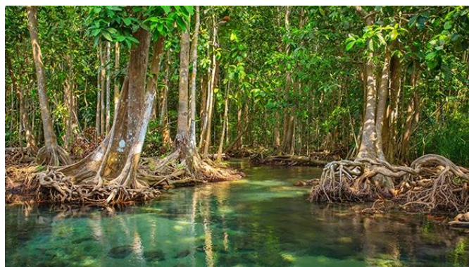
Above: Mangroves, one of the species of tree that sequesters the most carbon.