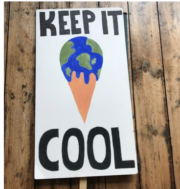
Left: Climate strike protest posters to be displayed in the exhibition.

Objects on display will include protest posters from the recent school climate strikes, now part of the SMG Collection.