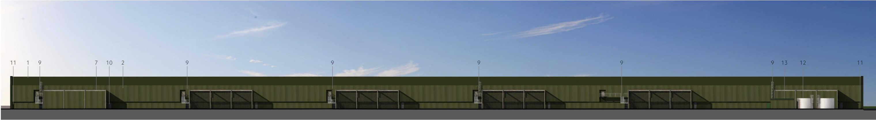
North-East Elevation 1:750 @ A3