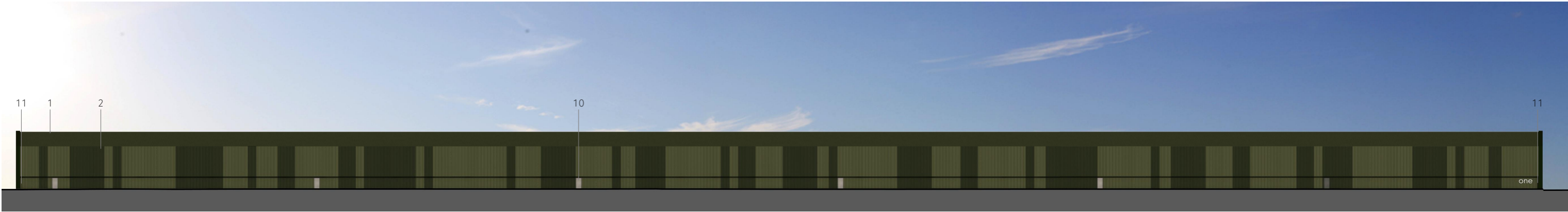
South-West Elevation 1:750 @ A3