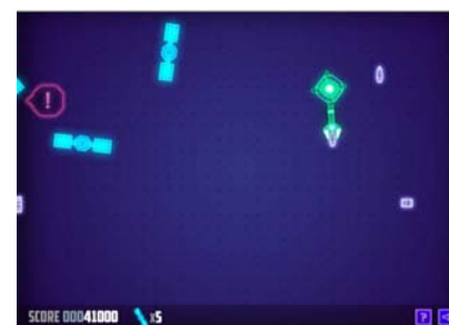
Clear the space junk that threatens the satellites we depend on.