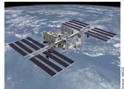
Scientists from all over the world work together on the International Space Station, the biggest satellite in low Earth orbit. A piece of orbiting junk came dangerously close to colliding with it in June 2011.