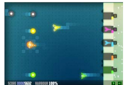
Use your Robo-Lobsters to keep the harbour safe from incoming mines.