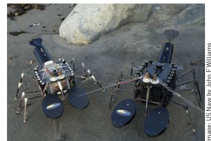
Robo-Lobster is a biomimetic underwater autonomous robot designed to move in shallow water just like a real lobster. It uses an electronic nervous system which is programmed to behave the way a lobster does as it searches its environment.